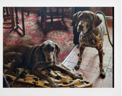
EVERYONE NEEDS A BLANKIE...